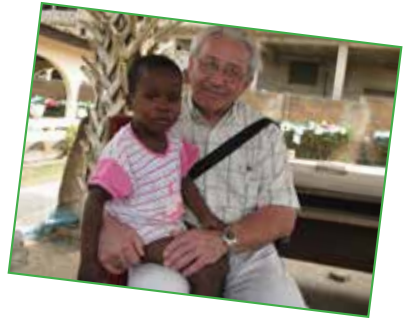
Grandpa bonding with a child who was just brought to the home during their last visit.