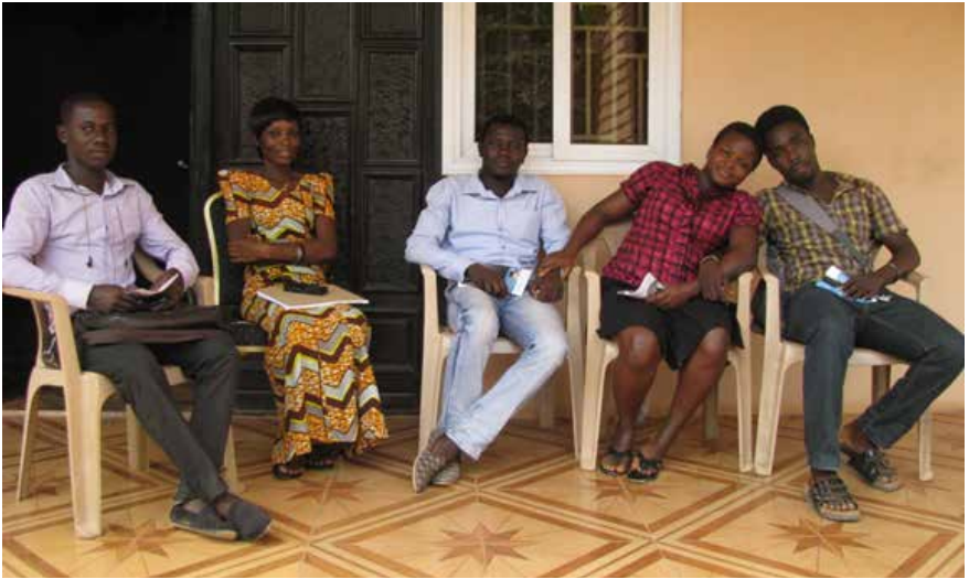
Four LEAF students along with the LEAF program administrator